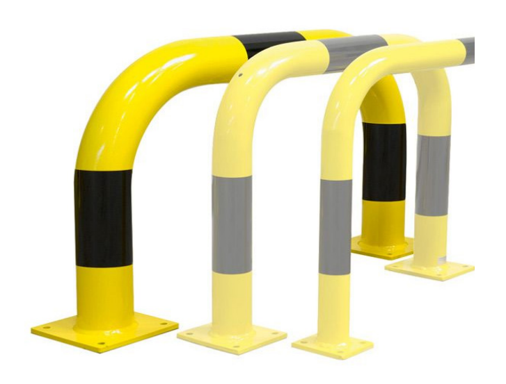
Yellow & black powder coated for visibility