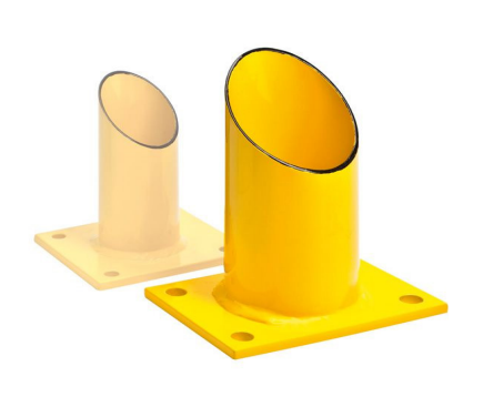
Featuring a 108mm diameter for thickness and durability